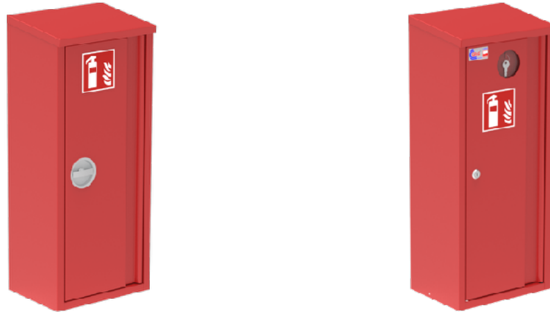
Extinguisher cabinet G-100/G-102 Extinguisher cabinet 6÷12 kg.